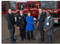
Fire Trucks Donated

working with Dunstable Community Church and the Bedfordshire Fire and Rescue Service to participate in establishing a fire service in three communities in Kenya. CFO